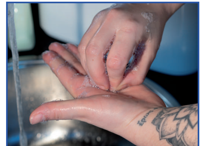
8 Rub the tips of the fingers in the opposite palm using a circular motion