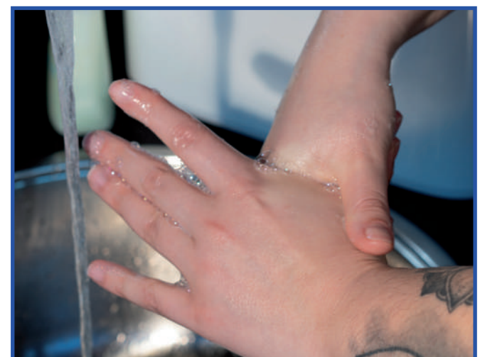
Rub each thumb clasped in the opposite hand using a rotational movement

6 Rub with the backs of fingers to opposing palms, with fingers interlaced